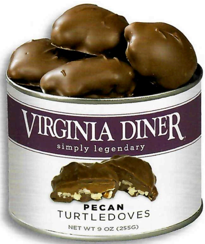
PECAN TURTLEDOVES ⓈD Crispy Pecans smothered in chewy caramel and enrobed in rich milk chocolate. #1151 9 oz. $22

== we've got the sweets == FIRST CHOICE FOR CHOCOLATE LOVERS