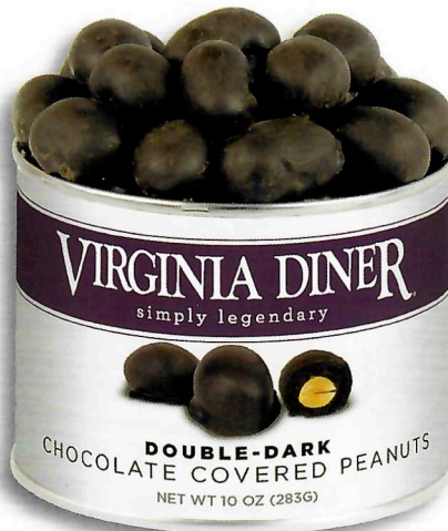
DOUBLE-DARK CHOCOLATE COVERED PEANUTS ⓈD Two layers of rich, velvety dark chocolate cover our wholesome Virginia Peanuts. #1716 10 oz. $15