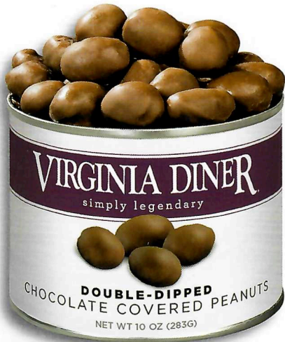
DOUBLE-DIPPED CHOCOLATE COVERED PEANUTS ⓈD Crunchy Virginia Peanuts drenched in two thick layers of creamy milk chocolate. #1711 10 oz. $15