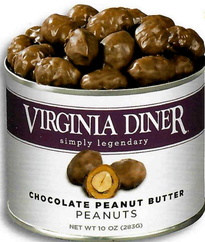
CHOCOLATE PEANUT BUTTER PEANUTS ⓈD Triple the goodness with peanuts, peanut butter, and creamy milk chocolate! #7211 10 oz. $18