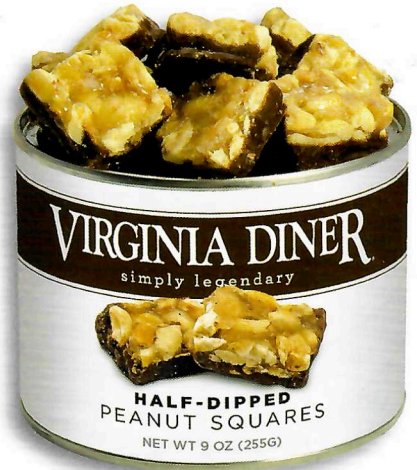
HALF-DIPPED PEANUT SQUARES ⓈD Old Fashioned Peanut Squares, hand dipped in a velvety chocolate coating. #1144 9 oz. $15