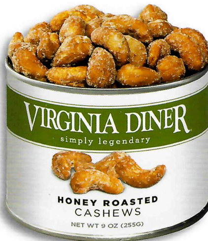
HONEY ROASTED CASHEWS U Jumbo Cashews cooked with light amber honey, sugar, and salt. #5117 9 oz. $22