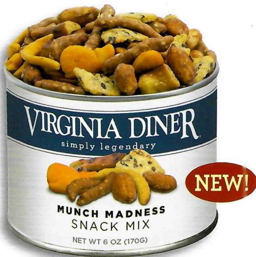
MUNCH MADNESS SNACK MIX UD Loaded with Honey Roasted Peanuts and Sesame Sticks, Cheddar Cheese Crackers, Chili-Lemon Corn Sticks, Honey Mustard Pretzel Sticks, and Corn Chips with Flax Seed! #2118 6 oz. $15