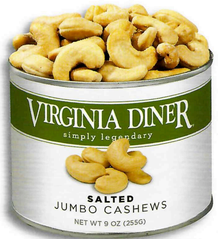
SALTED JUMBO CASHEWS U An all-time favorite treat. Delicately roasted and salted to perfection. #5111 9 oz. $22