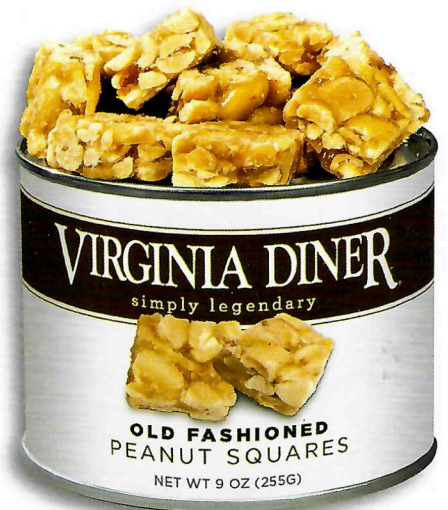
OLD FASHIONED PEANUT SQUARES UD The well-loved flavor of old fashioned brittle in bite-size pieces. #2054 9 oz. $15