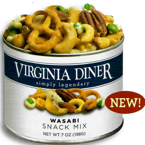
WASABI SNACK MIX UD A tasty blend of Peanuts, Natural Rice Snacks, Hot Cajun Corn Sticks, Wasabi Peas, Mustard Pretzels, Cashews, Pecans, and Almonds. #2115 7 oz. $15