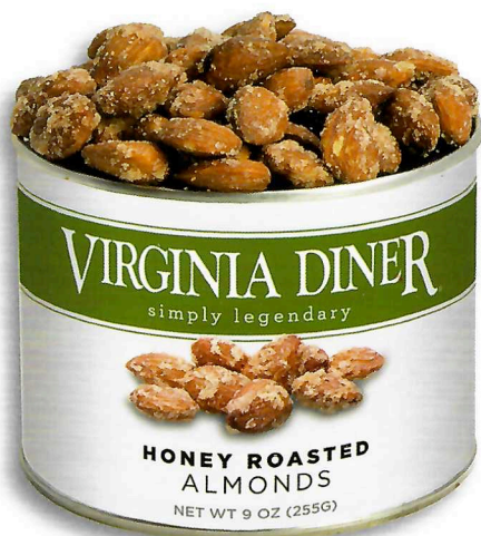
HONEY ROASTED ALMONDS U California Almonds roasted with sweet honey and a touch of salt. #3112 9 oz. $20