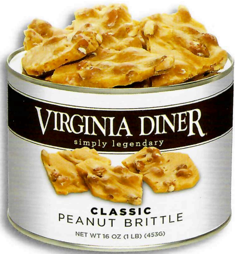
CLASSIC PEANUT BRITTLE UD Everyone's favorite snack. Crunchy Peanuts blanketed with the perfect blend of brittle candy. #7118 16 oz. $22