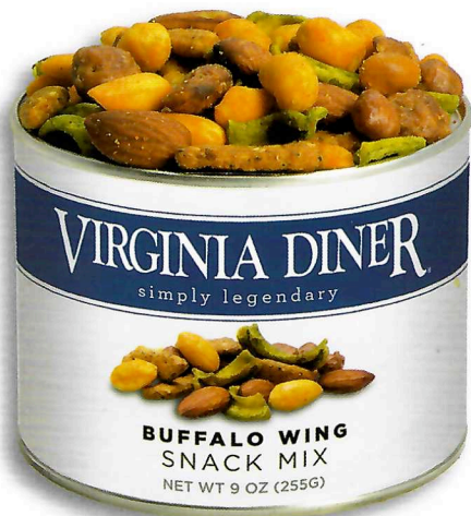
BUFFALO WING SNACK MIX UD Buffalo Seasoning with Virginia Peanuts, Butter Toasted Peanuts, Almonds, Everything Seasoned Sticks, and Guacamole Bites. #2126 9 oz. $15